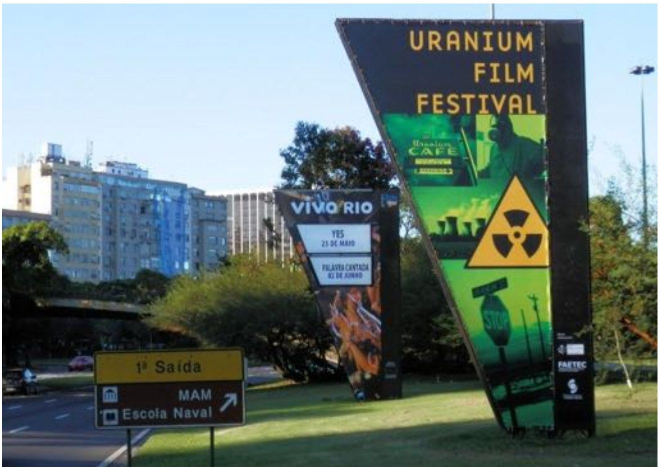
The huge outdoor banner of the Uranium Film Festival in front of the Museum of Modern Art at Flamengo Park in the centre of Rio de Janeiro: Design MAM, financed by Istituto Italiano di Cultura Rio de Janeiro.

1 Photo Exhibition "India in White and Black. Buddha Weeps in Jadugoda."