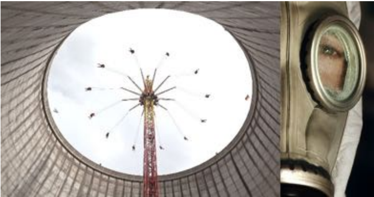
Stills of the films "Unter Kontrolle" and "Yuris Omen"