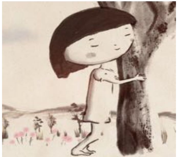
Still of Abita

"I selected Abita, because it is a very poetic, sensitive movie and very well done."