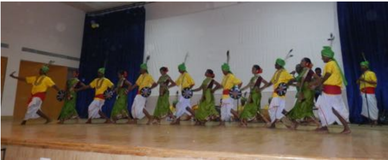
Uranium Film Festival opening in Ranchi – Central University of Jharkhand.