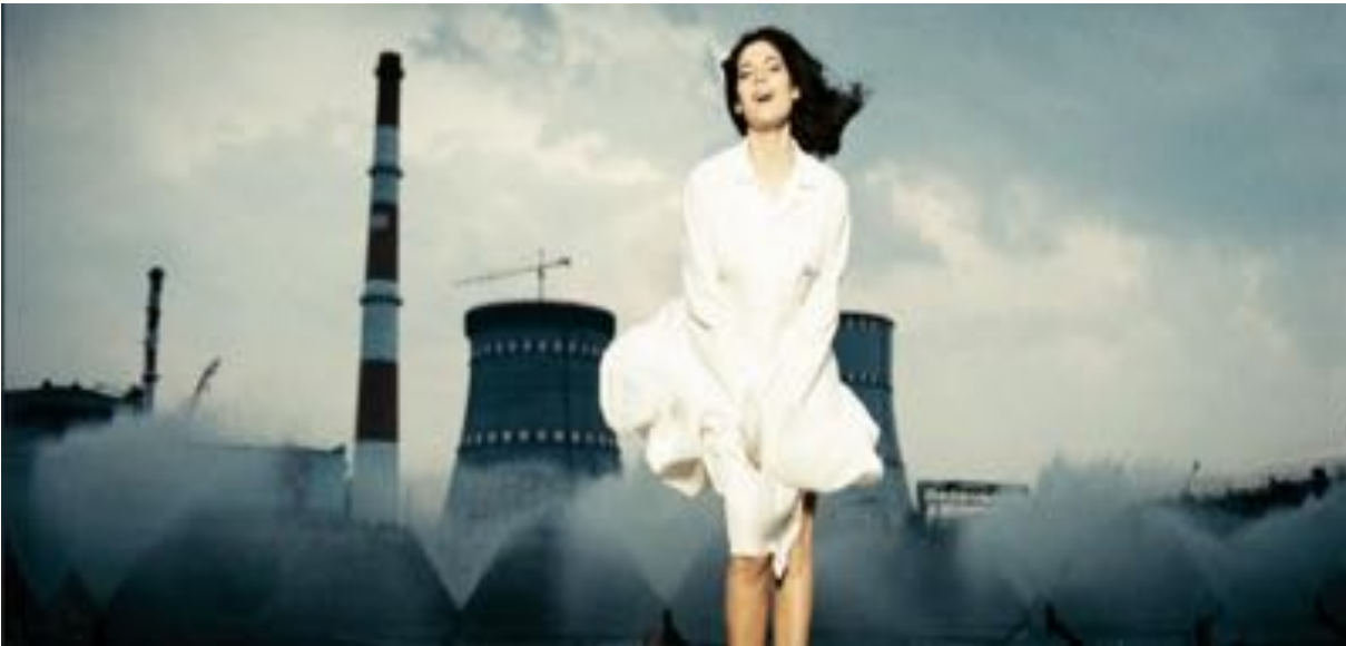
Still of "Atomic Ivan"