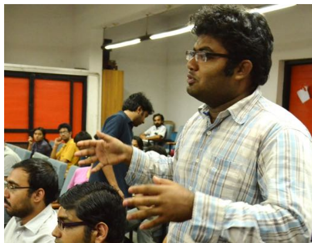
The Uranium Film Festival in India attracted many of students and multipliers and provided space for debates about the question of nuclear power, uranium mining and energy.

More than 50 films were scheduled to be screened in six cities of India. The festival also had a photo exhibition "Jadugoda Drowning in Nuclear Greed" of young photographer Ashish Birulee on health hazards of the people of Jadugoda due to uranium mining. This exhibition was also shown during the Uranium Film Festival at the Museum of Modern Art in Rio de Janeiro last year.