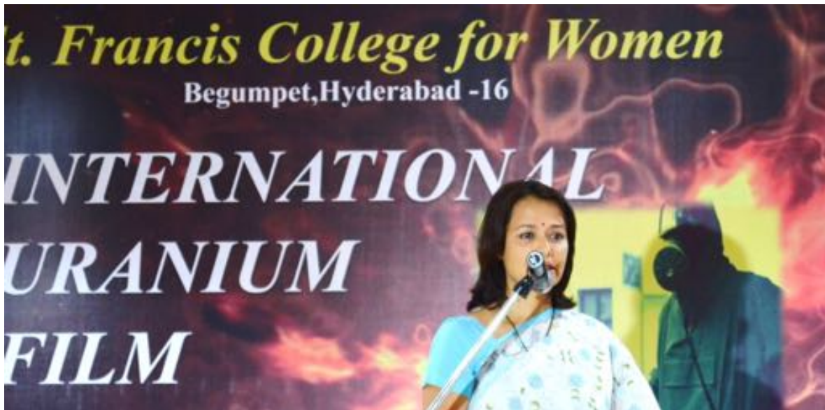
International Uranium Film Festival India Highlight: Actor turned activist Amala Akkineni at St. Francis College for Women in Hyderabad.

In addition, IUFF 2014 intended to raise issues from mining, Nuclear power plant and others particularly in this election year and wanted a clear discourse among the political parties over environmental and radiation exposure compensation legislature for radiation victims where damages have already been done.