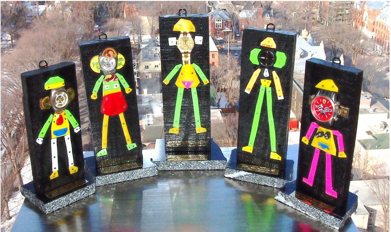
The International Uranium Film Festival trophy.