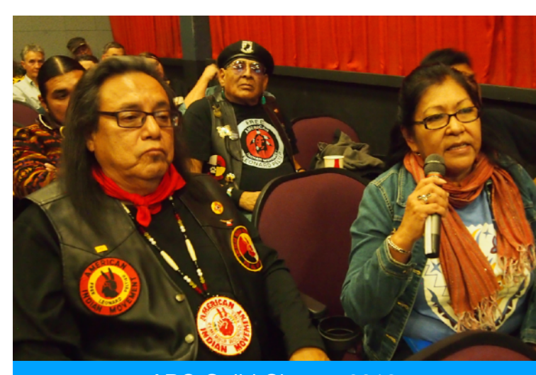
ABQ Guild Cinema 2018