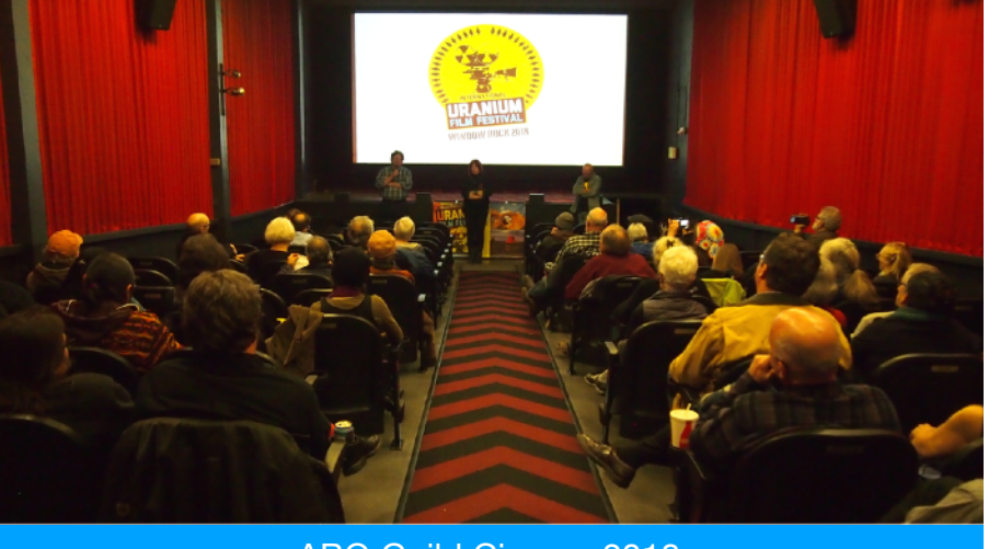
ABQ Guild Cinema 2018

Why now? The world is at war in the Ukraine, with threats of nuclear weapons use. The risk of the use nuclear weapons is big as never before since the U.S. A-Bomb attacks on Nagasaki and Hiroshima. U.S has announced it will be shipping depleted uranium weapons to the Ukraine to be used in the battle field. In the