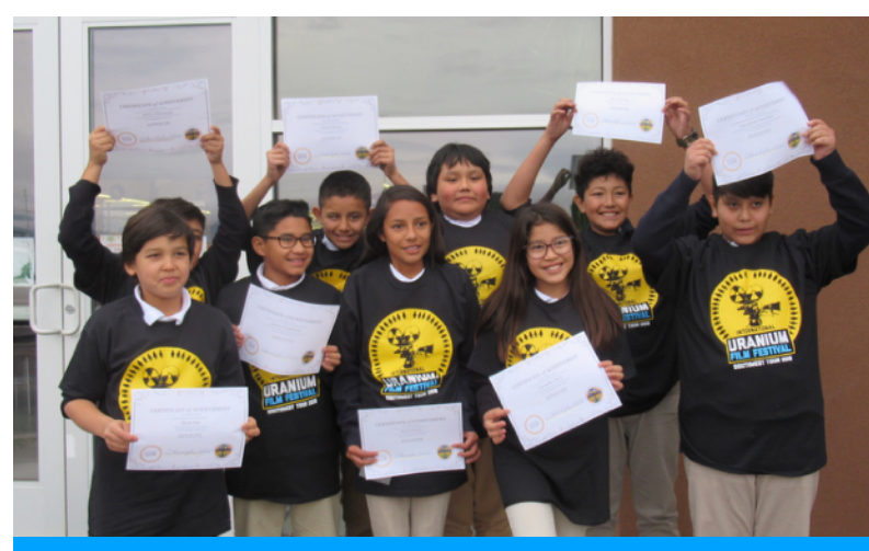
Grants Library 2018

We are looking for organizations and NGOs to join with us, and have made it easy for you to join us.