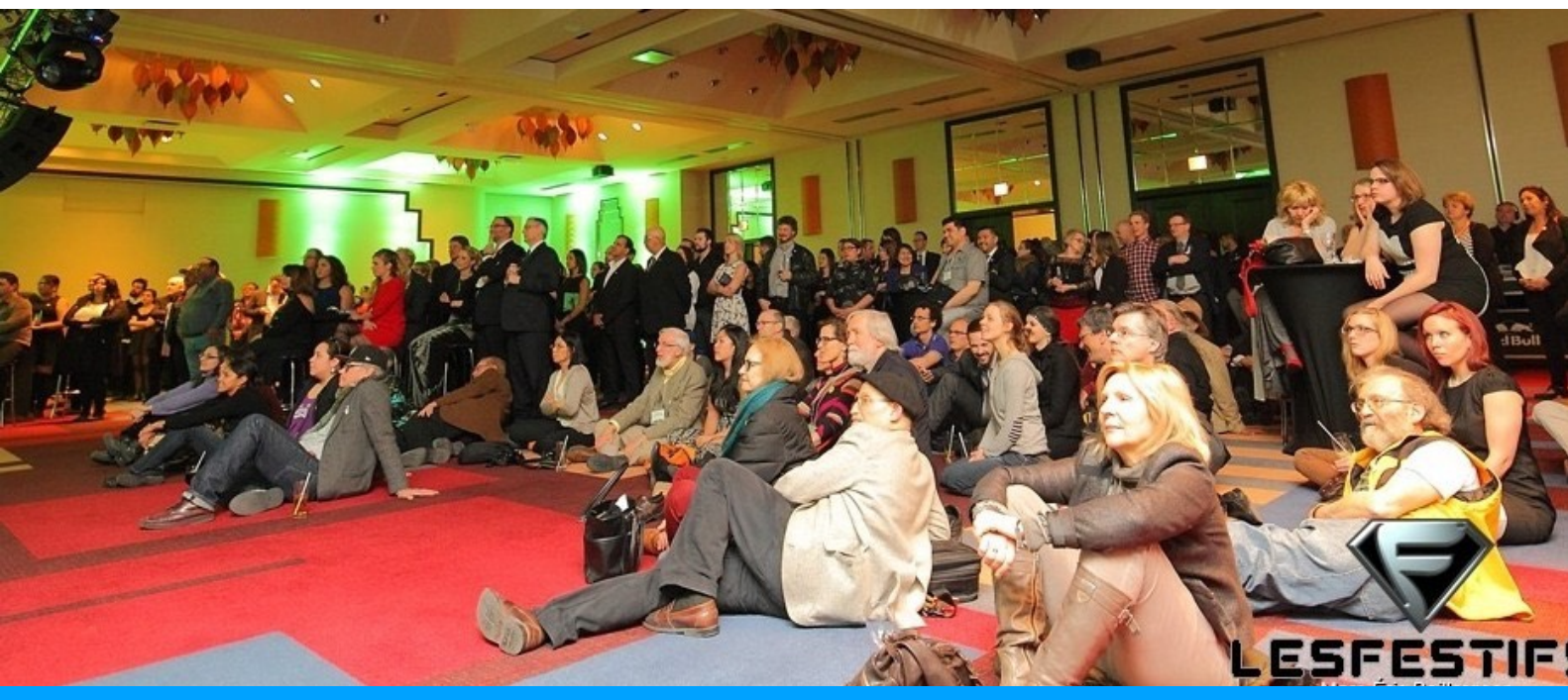
Quebec City Hotel Le Concorde 2025