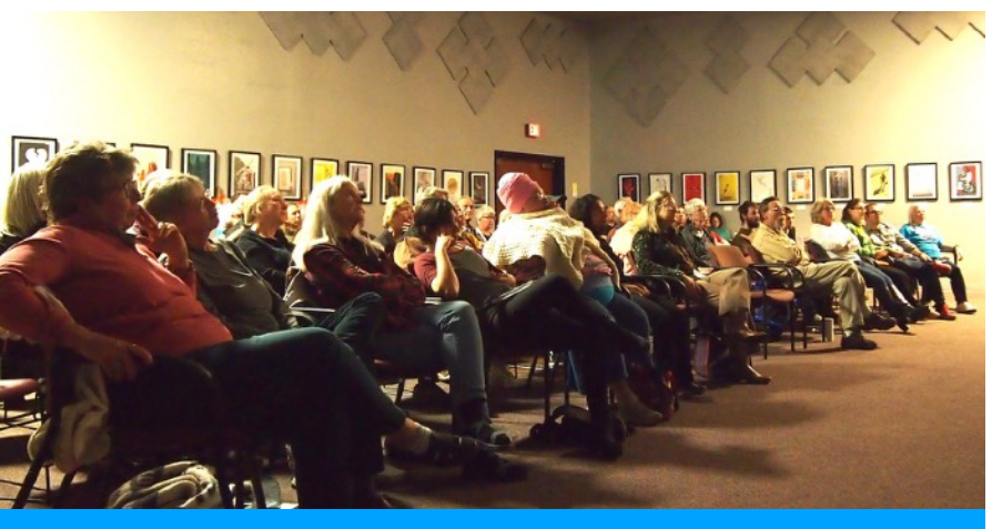
Tucson Frances McClelland Community Center 2018

The participants or local organizers in each destination select a venue for the festival and provide basic accommodations for the two person festival team. Depending on the local organizers the showings can be entry-free or have a ticket cost. If free, after the screenings we will ask the audience for donations to cover the travel costs to the next destination. If the venue is a cinema with an entry fee, we would share it 50/50 with the cinema.