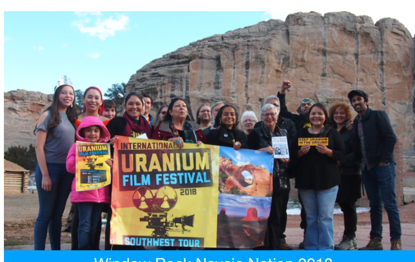
Window Rock Navajo Nation 2018

The International Uranium Film Festival (IUFF) plans to return to the United States of America in March/April of 2024 for an extended tour across the country. At each stop, it will show a selection of movies and documentaries curated for that area of the country about the use of nuclear power and atomic weapons, stimulating the discussion on these vital topics for the future of humanity.