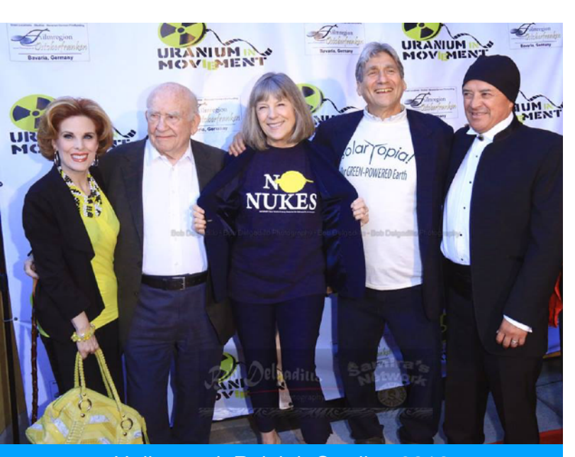
Hollywood Raleigh Studios 2016