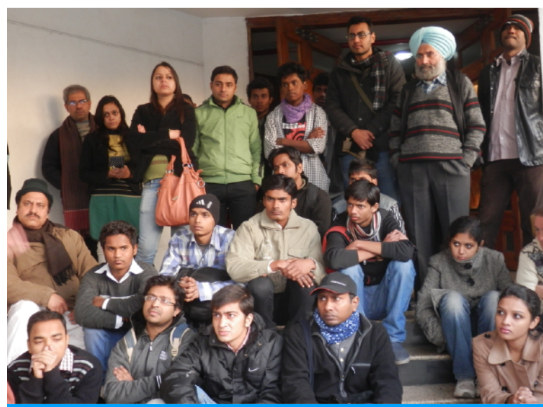
New Delhi Siri Fort Cinema 2013