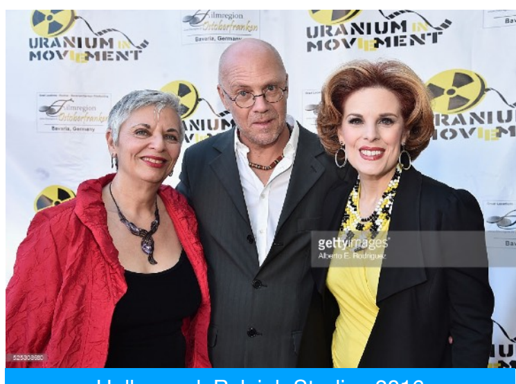
Hollywood Raleigh Studios 2016