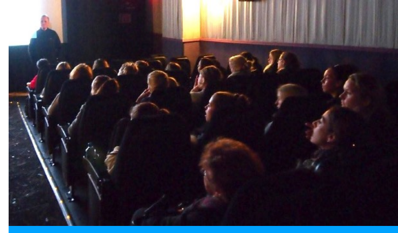
New York Brooklyn Cinema 2014