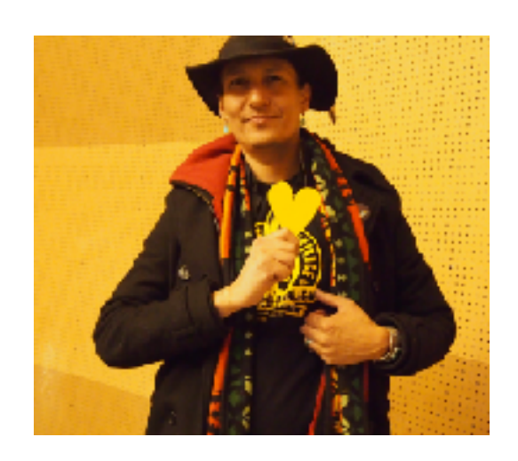
In memory of Klee Benally . Navajo / Diné artist, activist and filmmaker. We are honoured that he created the poster and t-shirt designs of the International Uranium Film Festival tours in USA in 2018 and 2024.