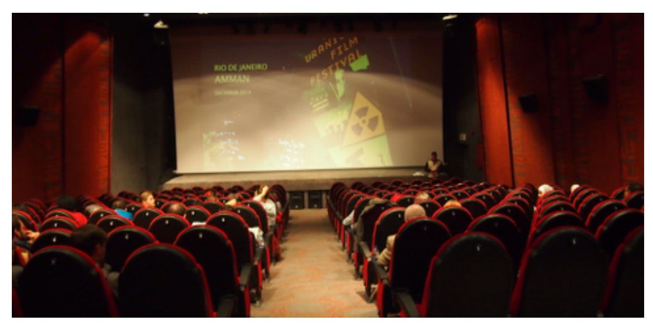
RAINBOW THEATRE AMMAN

Jabal Amman, 1st Circle, Rainbow Street, جبل عمان - الدوار الأول - شارع الرينبو, Jordan