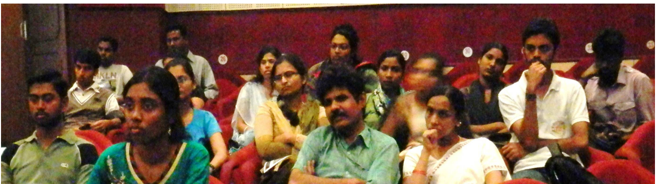
Uranium Film Festival in Hyderabad – Screenings in the University of Hyderabad, Gachibowli.

In continuing of the "Travel to India" the focus of the 3rd edition of the festival in Rio de Janeiro too was India. The aim was clear: stimulation and influencing the discussion on nuclear energy in the largest democracy of the world - and in Brazil - at a time, when thousands of local people demonstrated against South-India's new nuclear power plant at Kudankulam. Other countries like Germany are abandoning nuclear power, but India and Brazil are currently investing in nuclear energy. And, like Brazil, India has not only nuclear plants but also uranium mining to produce the nuclear fuel. Moreover, India and Brazil are partners in the new geopolitical union in favour of nuclear energy in the world, known as BRICS: Brazil, Russia, India, China and South-Africa.