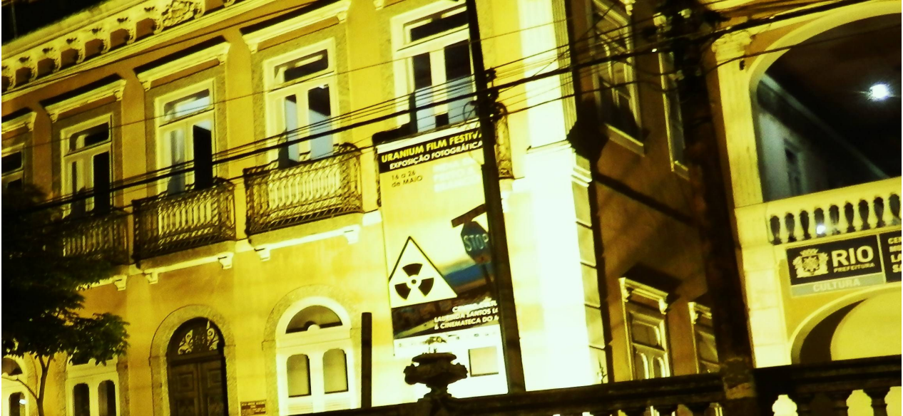
Façade of the Municipal Cultural Centre Laurinda Santos Lobo during the photo exhibition “India in Black & White” in Rio de Janeiro, Santa Teresa..