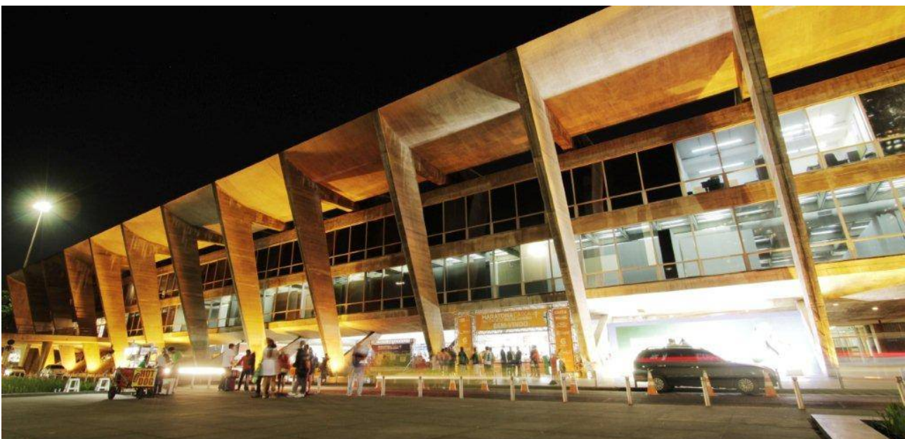
Modern Art Museum Rio de Janeiro

In total about 300 students participated the festival in the cinema of MAM and watched films like High Power by Pradeep Indulkar, India, or the comedy Curiosity Kills by Sander Maran, Estonia.