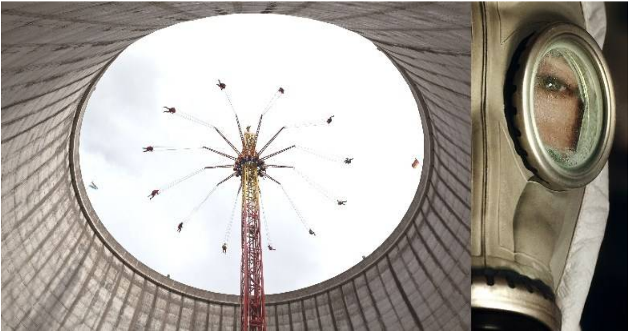
Stills of the films "Unter Kontrolle" and "Yuris Omen"