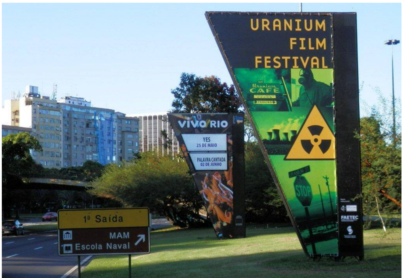
The huge outdoor banner of the Uranium Film Festival in front of the Museum of Modern Art at Flamengo Park in the centre of Rio de Janeiro: Design MAM, financed by Istituto Italiano di Cultura Rio de Janeiro.

1 Photo Exhibition "India in White and Black. Buddha Weeps in Jadugoda."