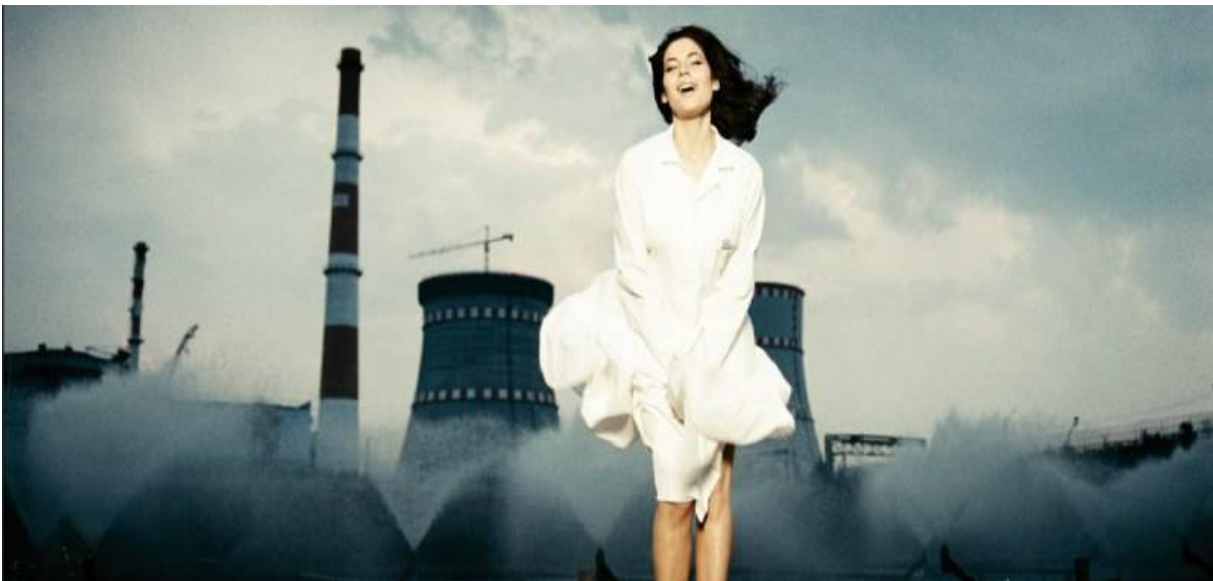
Still of "Atomic Ivan"