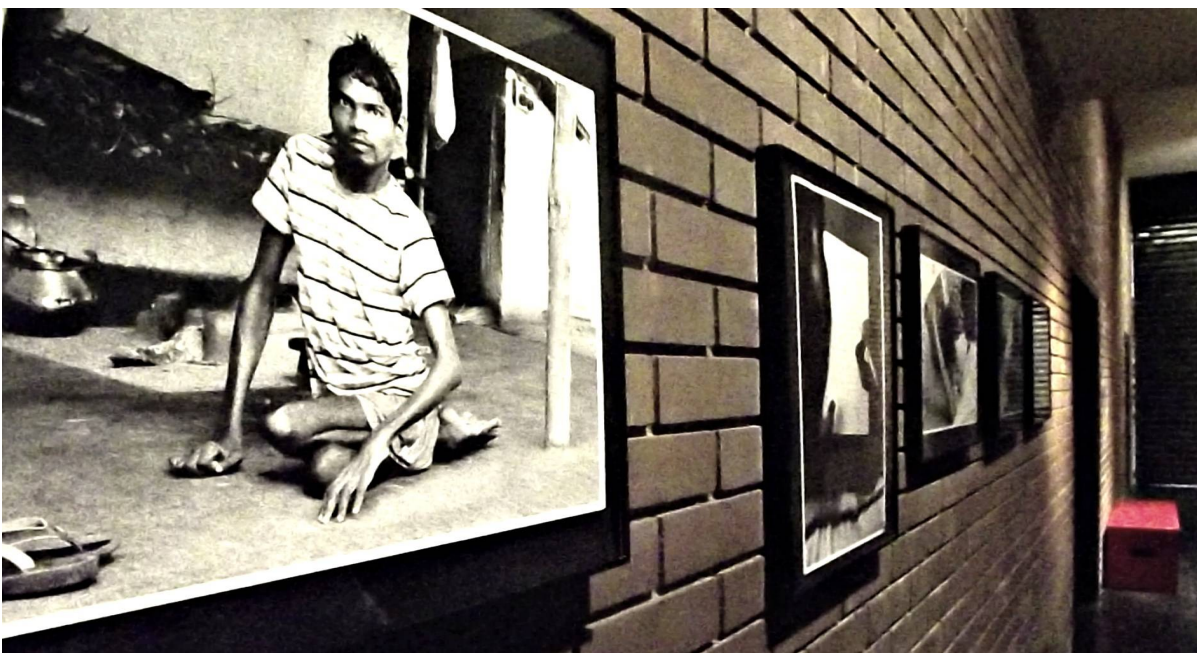
Cinemateca do Museu de Arte Moderna (MAM-Rio)

The two different locations of the exhibition was chosen to connect two cultural important locations of Rio de Janeiro: MAM at the Beach of Flamengo and the famous artistic quarter Santa Teresa with its high tourism potential. Initially, the exhibition in Santa Teresa was planned to be inaugurated on the first of May, about two weeks before the festival opening at MAM. But unfortunately the Cultural Centre Laurinda Santos Lobo was - unforeseen - closed by the City authorities to meet new requirements of fire safety. Luckily at the very last moment, one day before the opening of the festival in MAM, the festival team could install the Exhibition in Cultural Centre Laurinda Santos Lobo.