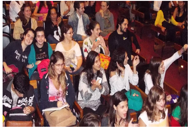
Students enjoying the film Curiosity Kills